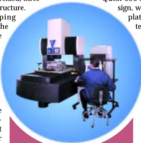
The Quest 650's software makes for seamless transitions so users can easily switch from one sensor type to the next.

Tom Groff, corporate products manager at OGP, points out that, from the operator's standpoint, the integration of all sensors used on a Quest 650 is seamless. "For instance," he says, "a shop measuring a part using optics can easily make the transition to a touch probe via a 'get-the-probe command.'" All the