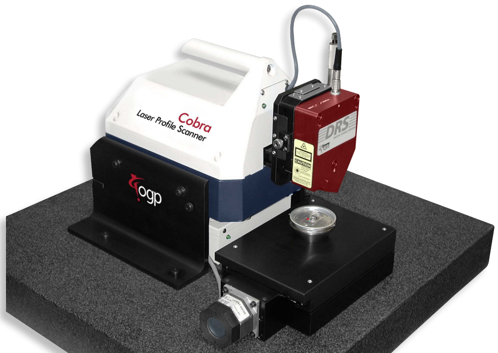
Cobra 3D, mounted on granite base (included).