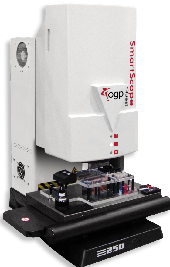
Shown with optional touch probe and change rack.