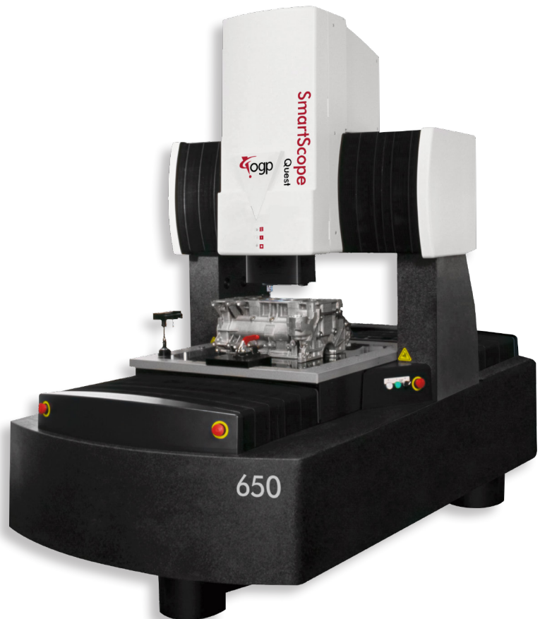
Shown with optional touch probe and change rack.