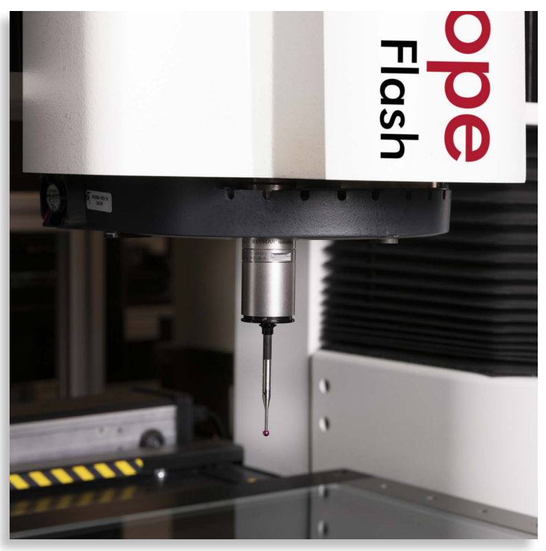
Machine shown with SP25M Scanning Probe.