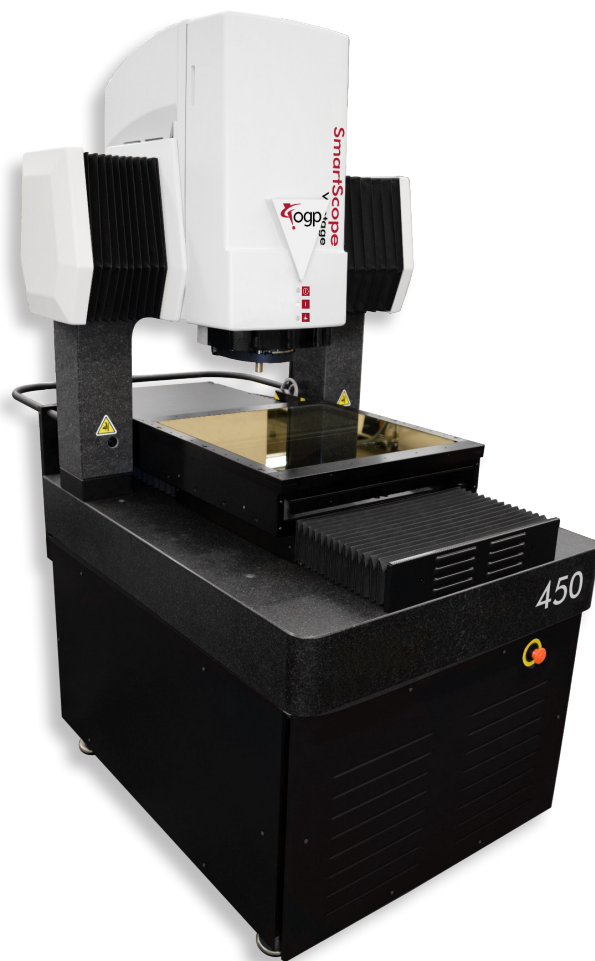
Shown with optional touch probe.