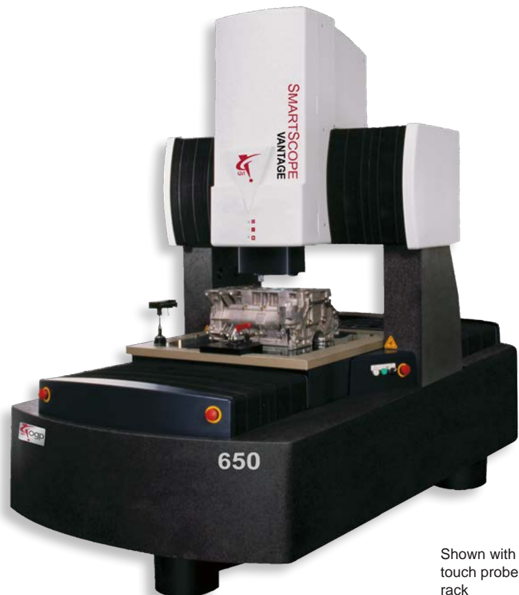
Shown with optional touch probe & change rack