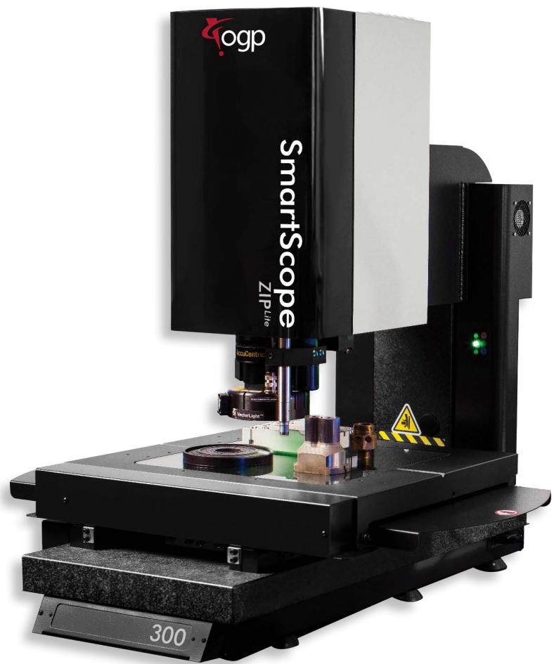
Shown with optional Touch Probe.